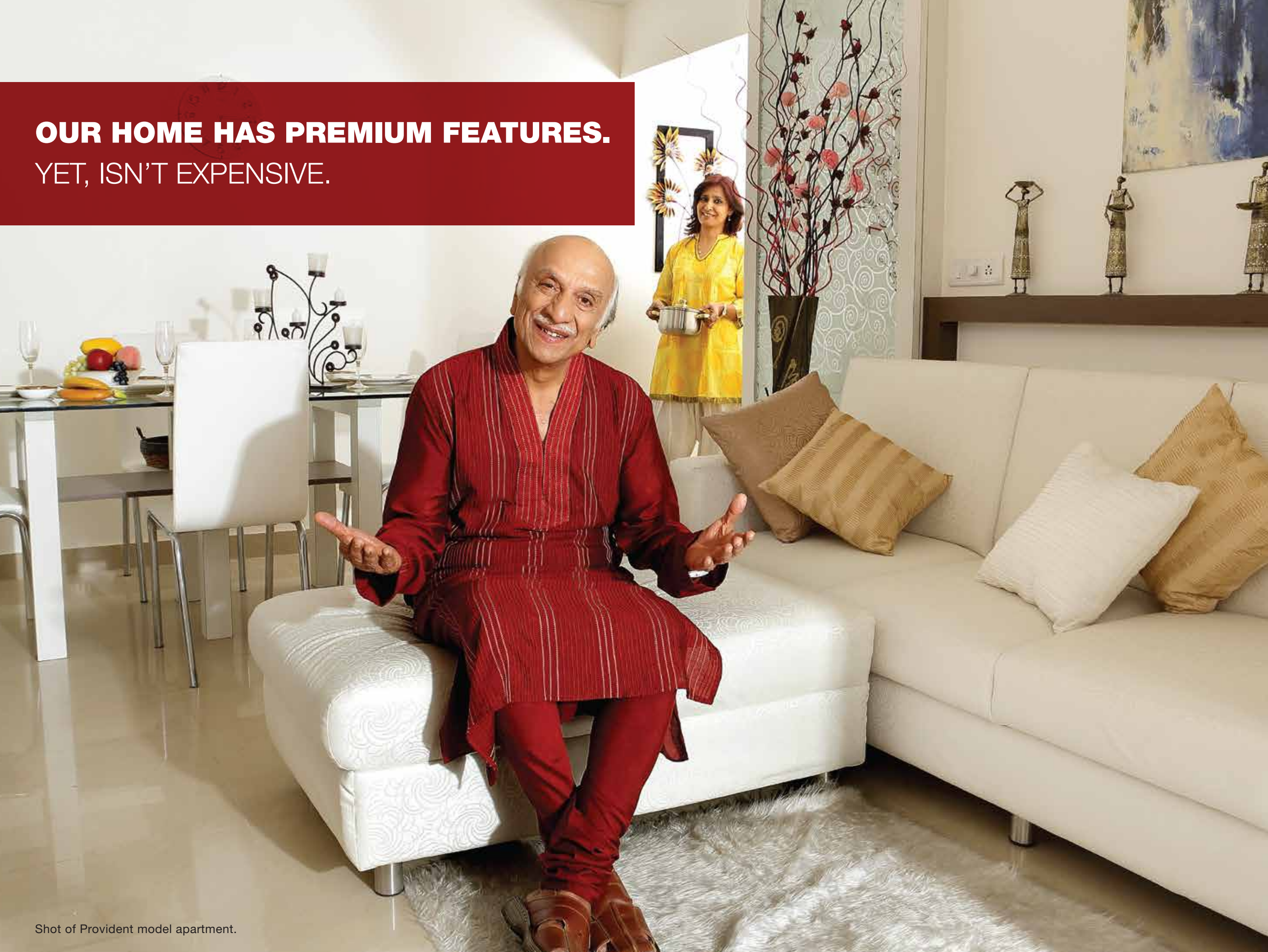
Shot of Provident model apartment.

OUR HOME HAS PREMIUM FEATURES. YET, ISN'T EXPENSIVE.