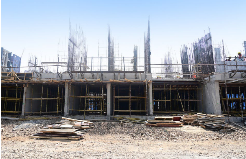
Actual site photograph