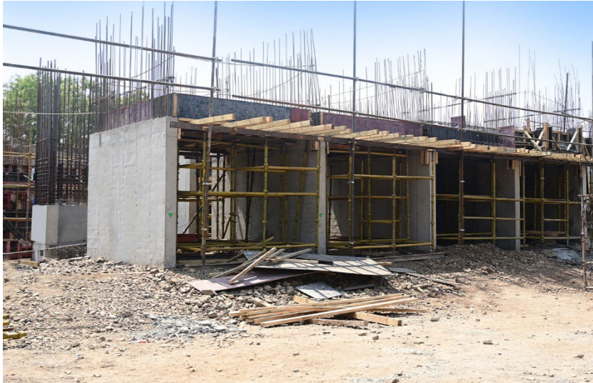
Actual site photograph