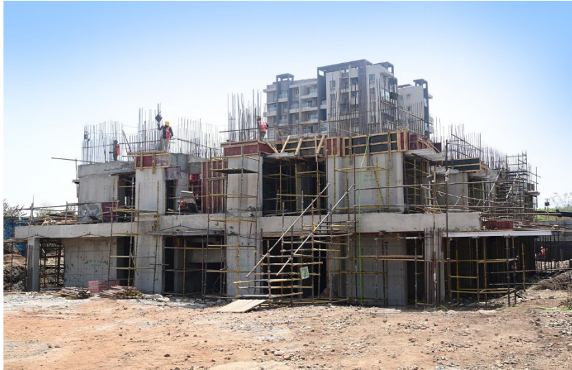
Actual site photograph