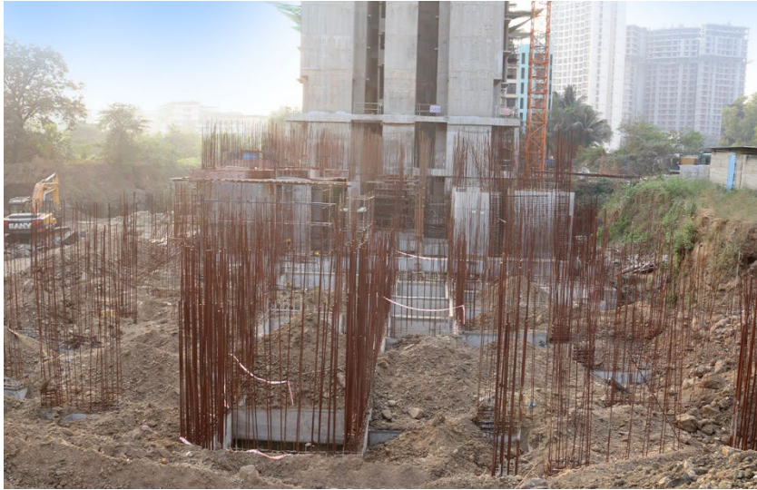
Actual site photograph