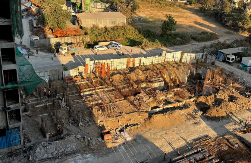
Actual site photograph