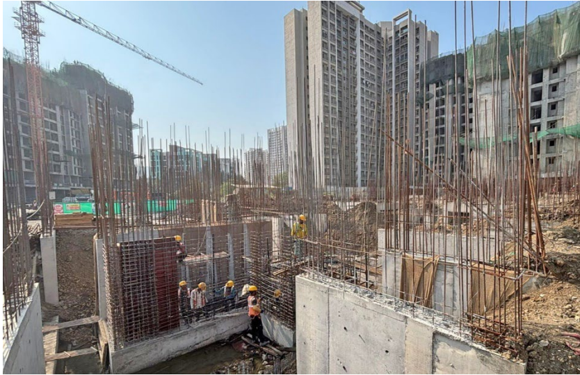
Actual site photograph