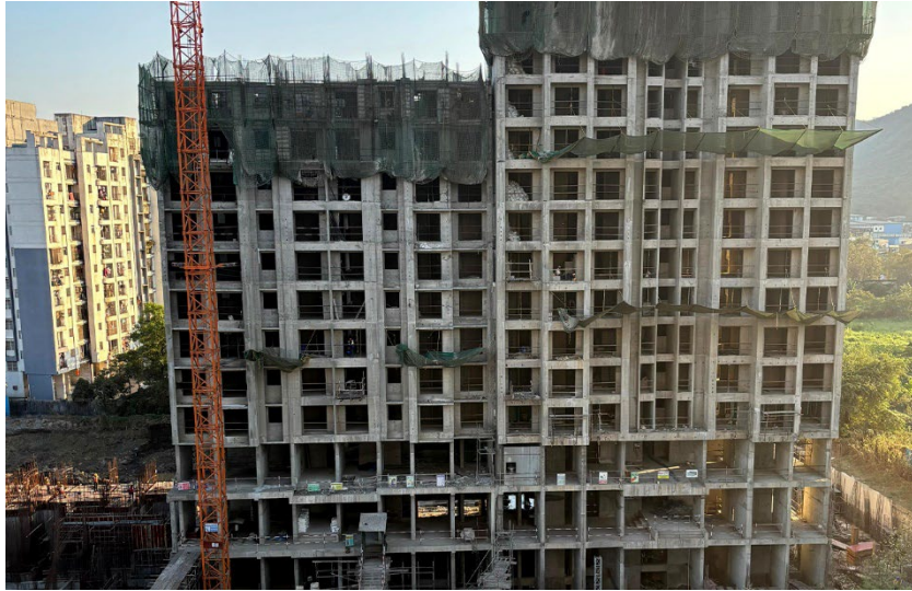
Actual site photograph