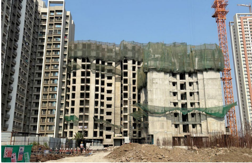
Actual site photograph