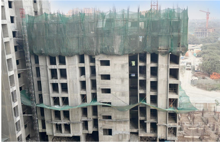
Actual site photograph