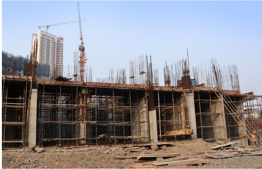
Actual site photograph