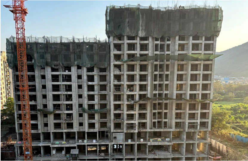
Actual site photograph