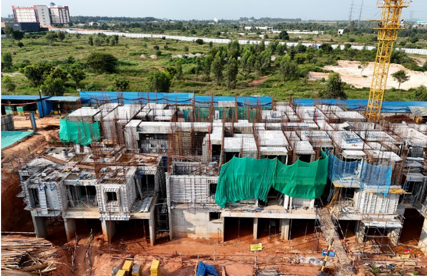
Actual site photograph