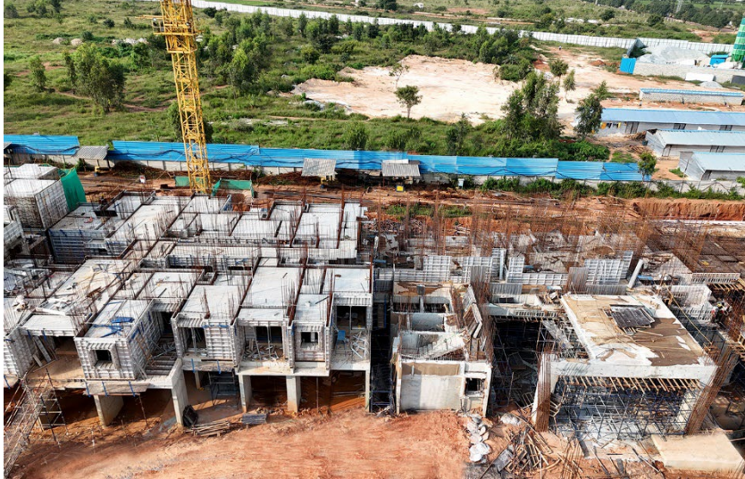
Actual site photograph