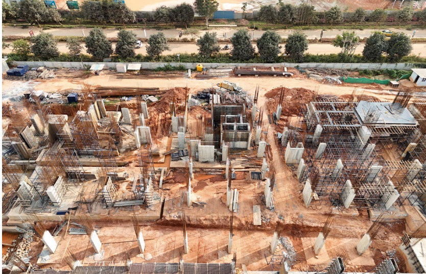
Actual site photograph