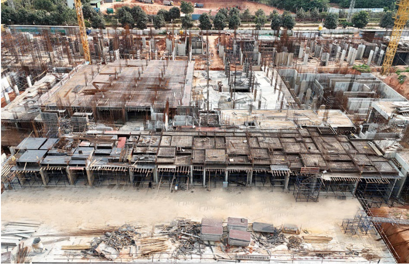
Actual site photograph