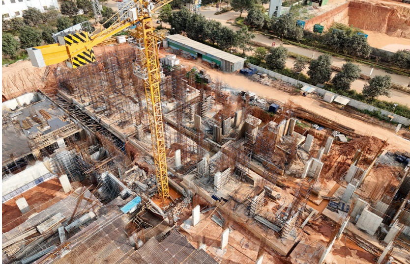
Actual site photograph