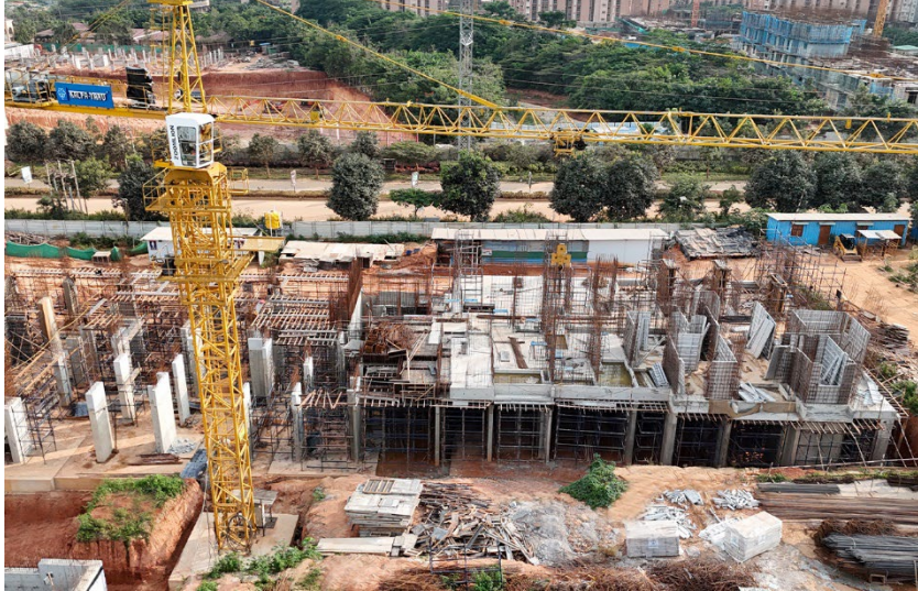
Actual site photograph