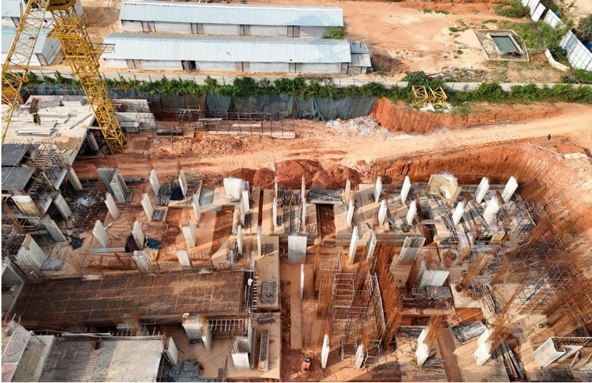
Actual site photograph